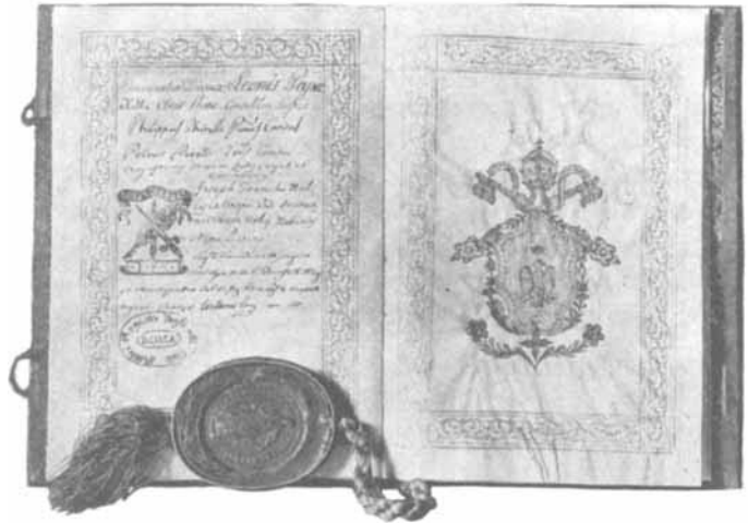
Fig. 9.—Franchise for the establishment of a Pharmacy signed by Pope Leo XII.

Aside from these books and official documents, the Squibb collection contains many others, among them a number of