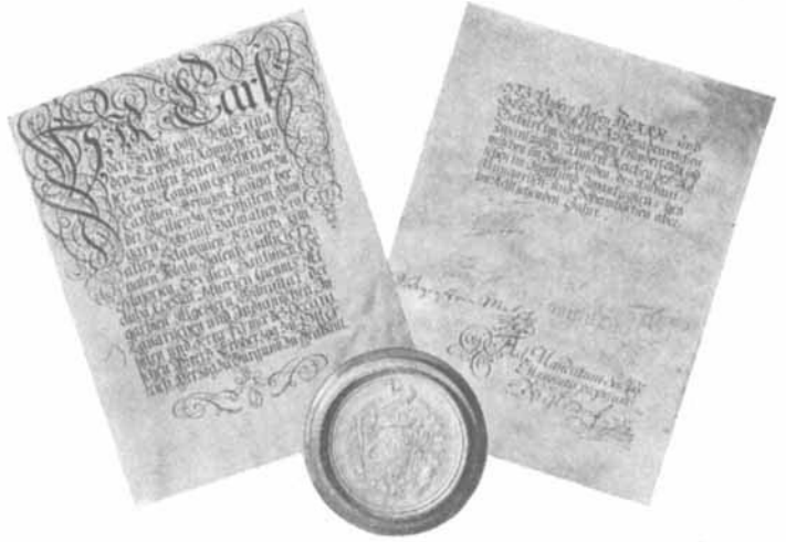
Fig. 6.—Royal franchise for the production and sale of "life pills" signed by Carl VI of the "Holy Roman Empire." Title page, signature page and seal.

Another franchise granted and signed in Vienna August 20, 1791, by Emperor Leopold II (Fig. 7) is a confirmation of an earlier