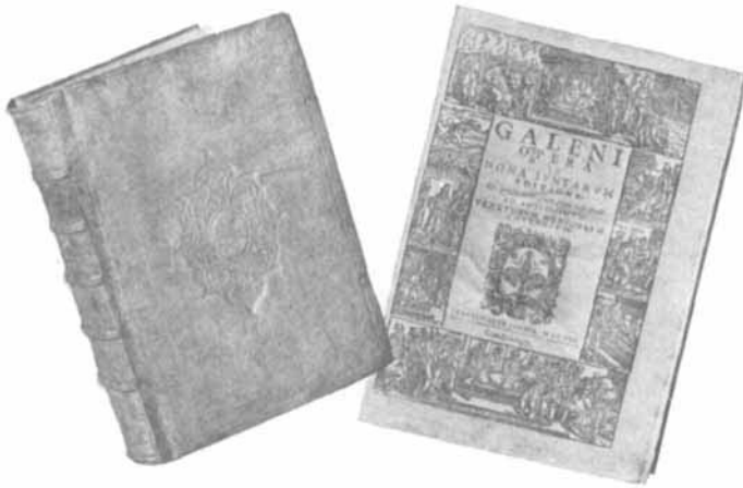
Fig. 4.—The works of Galen, one of the four volumes.

A formula for "sal volatile urinæ" a salt, to be prepared from the urine of young people, is mentioned but not recommended. The product, says the Pharmacopœia, is superfluous. Yet now we know of potent and valuable hormones available from urine of animals in certain stages of life.