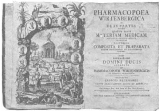
Fig. 3.—Württemberg Pharmacopœia of 1786.

the empirical, speculative and sometimes mysterious theories gradually gave way to knowledge resulting from the then-increasing scientific research. The "Pharmacopœia Wirtenbergica" of 1786, which we find in the Squibb collection, stands in the midst of this development. It not only contains