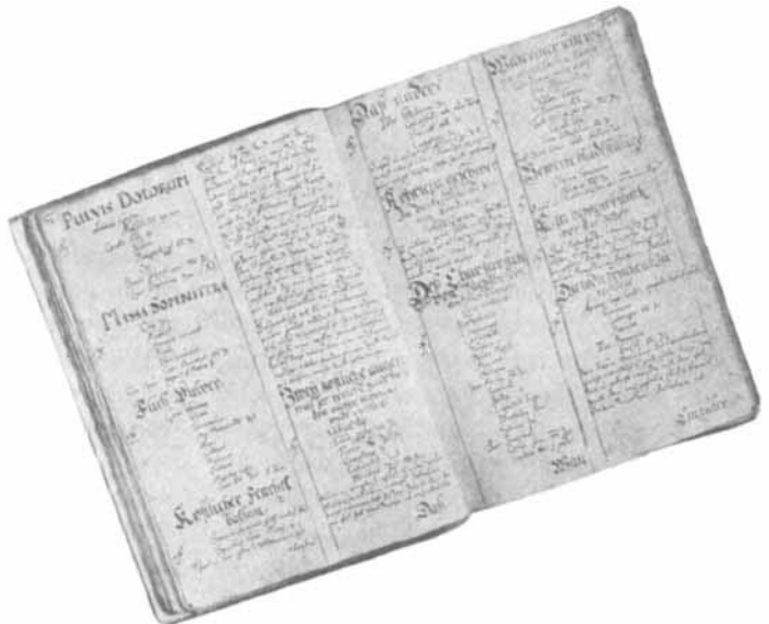
Fig. 5.—Handwritten formula book.

The Squibb collection has two of the finest examples of such nostrum privileges in existence. They are no mere documents but really books of many large pages of precious parchment, beautifully inscribed and splendidly bound.