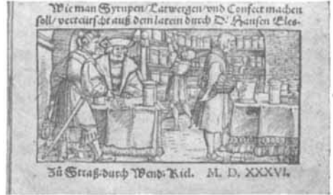
Fig. 2.—Woodcut showing 16th century pharmacy—from title page of "Reformation der Apotheken" printed 1536.

bula," are the "Hortus Sanitatis" (Garden of Health) printed in 1499 and the "Arzneybuch" (book of remedies), printed in 1479. It is most striking that they are not written in Latin, the language of the scientific world of those times but rather in the language of the people.