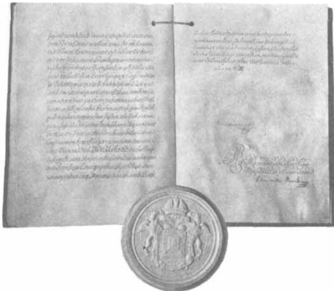
Fig. 7.—Royal franchise for the production and sale of "Trusinger's Plaster" signed by Emperor Leopold II, signature page of the large parchment document with seal.

How different the relatively plain document by which Frederic the Great of Prussia