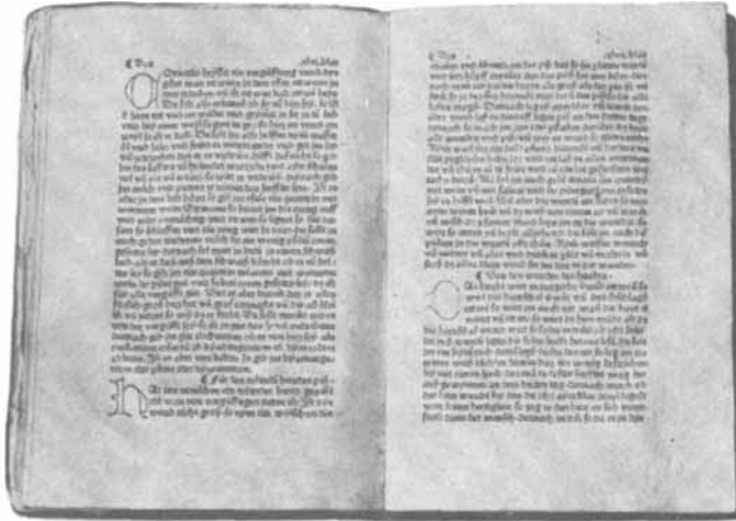
Fig. 1.—Incunabula—Ortolff's Arzneybuch printed 1479.

The "Hortus Sanitatis" and the "Arzneybuch" had many successors. Various her-